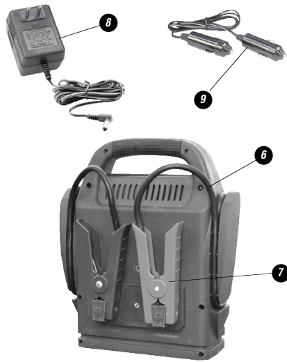
FIGURE 1B (Rear View)