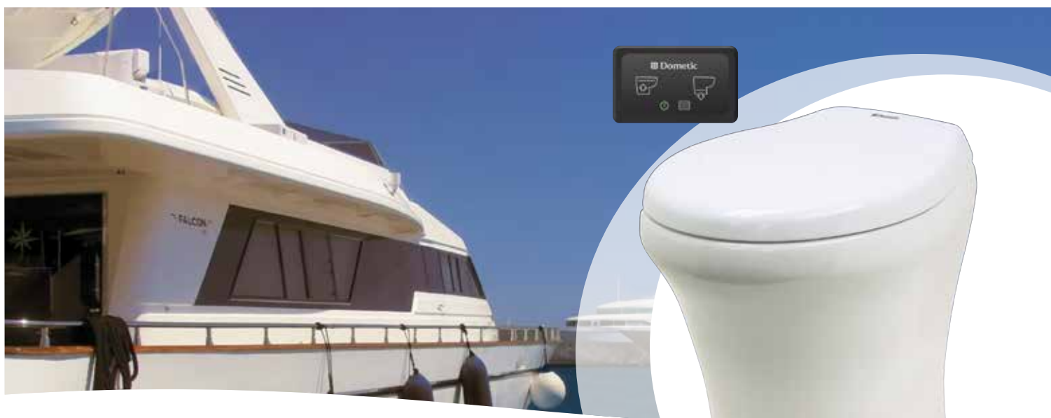
Model 8979 MasterFlush toilet with standard Dometic flush touchpad

Simple elegance. Unlimited possibilities.